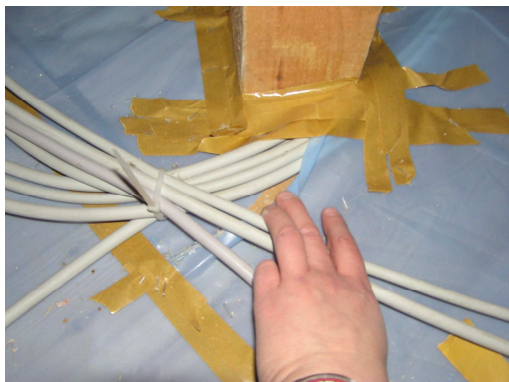
Leakage due to cable penetrations