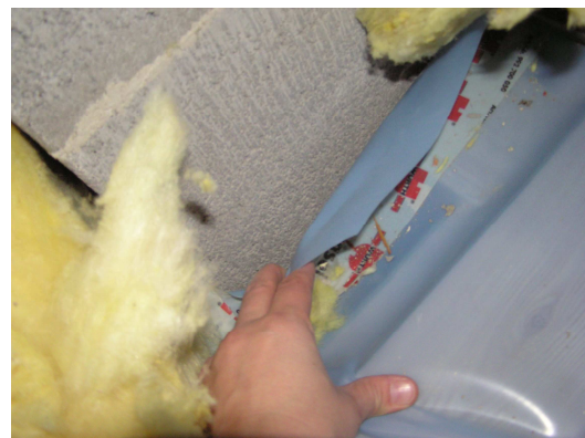
Leakage due to incorrect air insulation at a chimney junction