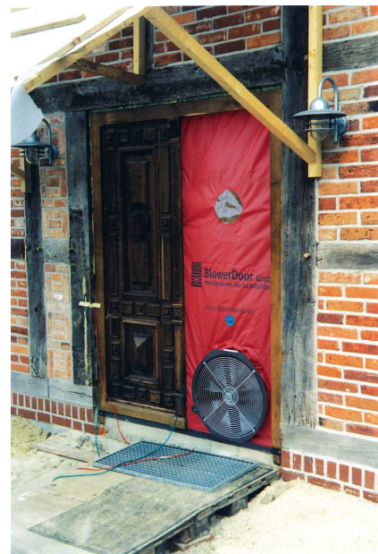
BlowerDoor measurement during the rehabilitation of a timber-framed house