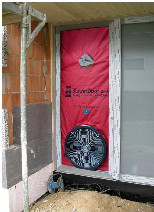
BlowerDoor test of a new single-family home

The BlowerDoor measurement allows you to test the air tightness of buildings. It can also protect against severe structural damage caused by warm and humid indoor air penetrating the building construction through joints. In addition, the comfort level rises, because you no longer have draughts or cold-air pools. When rehabilitating existing buildings, an air barrier planned according to the recognized standards often achieves current low-energy or even passive-house standards.