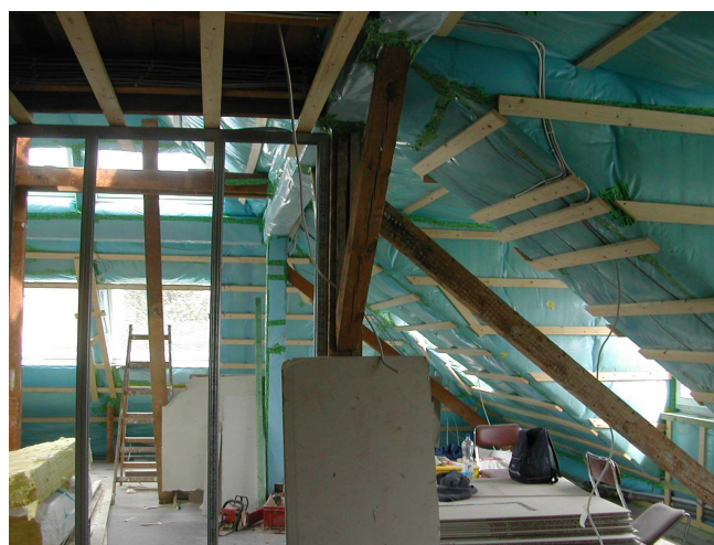
The air barrier is still visible (sheets and wood panels): This is the optimum time for a BlowerDoor measurement

According to the German Energy Savings Regulation, air-tightness measurements are to be conducted while the building is in use. We recommend an additional BlowerDoor test already at the time when the air barrier is still accessible. Leakages can then be eliminated in a targeted manner and often with little effort. Leaks that are only detected during an air-tightness test when the building is already in use, usually not only require more, but also considerably more costly rework.